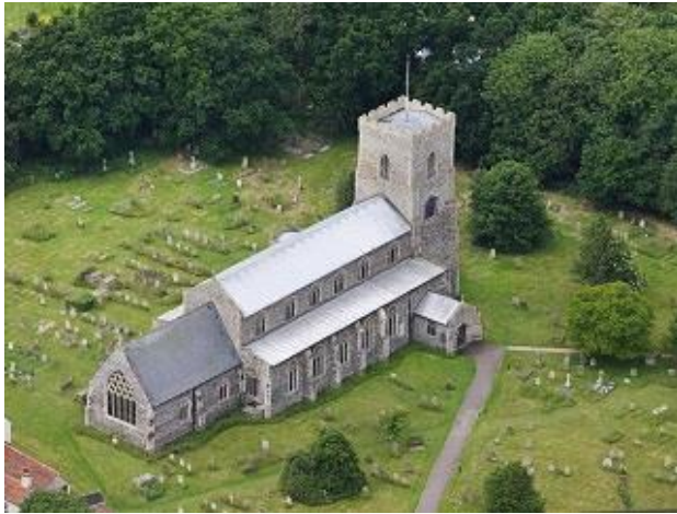
1 St Catherine's Church in Ludham

Walking times reflect a leisurely rather than brisk pace. All four are quite short, but can be joined up to make longer circular walks.