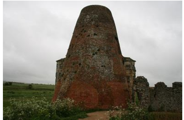
2 The 18th century mill, built on top of the Abbey gatehouse.

Cross the A1062 and follow this lane (Hall Road) to the next junction. A sign-post marked 'Restricted Byway to St Benet's Abbey' tells you to turn right down St Benet's Abbey Road which turns into a concrete farm track. Proceed along this track for 1 mile to arrive at the Abbey site.