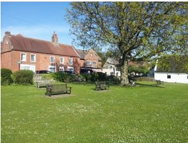
Horning Village lies between Wroxham and Ludham

Ludham and Ludham Bridge are currently served by bus routes, which will drop you a pleasant 30 minute walk away from St Benet's Abbey. The nearest railway station is Hoveton and Wroxham, 6 miles away.