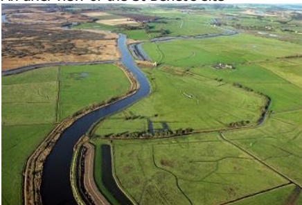
An ariel view of the St Benet's site

Please only park in the car park, which can accommodate 10 vehicles plus cycles; or consider parking at Ludham Bridge or Ludham village and walking the final mile or two.